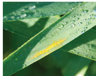
Stripe Rust in Wheat.