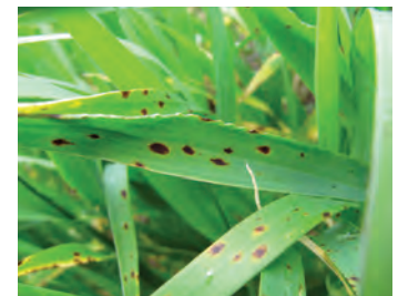
Net Form of Net Blotch in Barley.

Applying Veritas preventively will protect against visible disease symptoms and loss of valuable leaf area. Figure 1 below shows the excellent performance offered by Veritas against Stripe Rust.