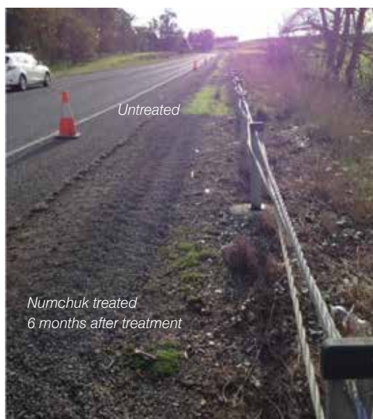
Peracto Trial: Sassafra, Tasmania, 2013-14