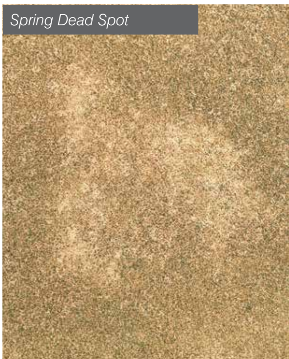
Spring Dead Spot

It is classified as a DMI inhibitor as it stops the demethylation step in the biosynthesis of ergosterol, a vital component of cell walls in many fungi.