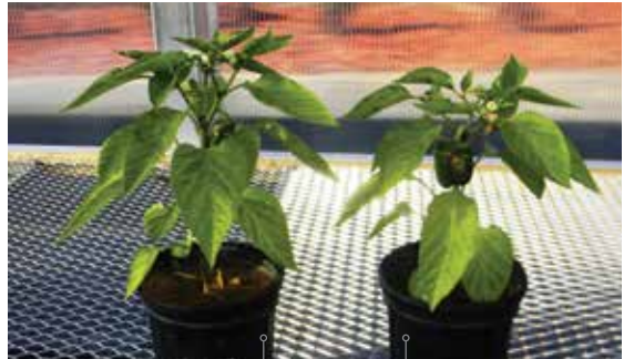
50/50 Potting Soil and Profile® Lawn & Landscape Porous Ceramic Soil Conditioner