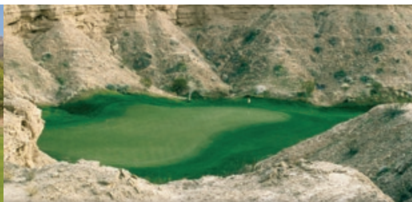
The greens at the Oasis Golf Course in Mesquite, Nevada, constructed with a sand/Profile mix in 1992, continue to thrive.