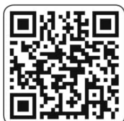
MSDS QR CODE