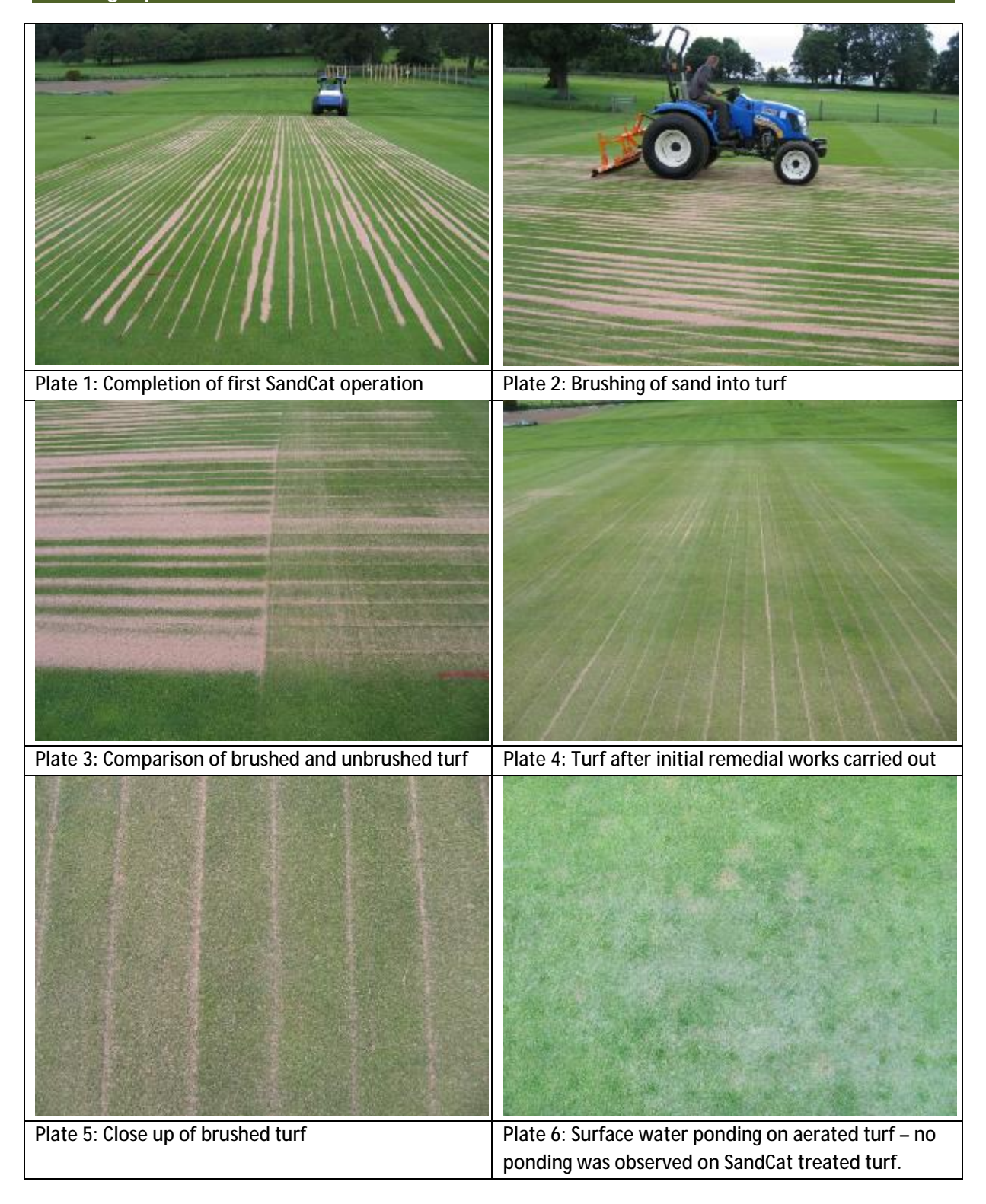
Plates 1-6: Photographs from SandCat treated turf and that receiving only aeration.