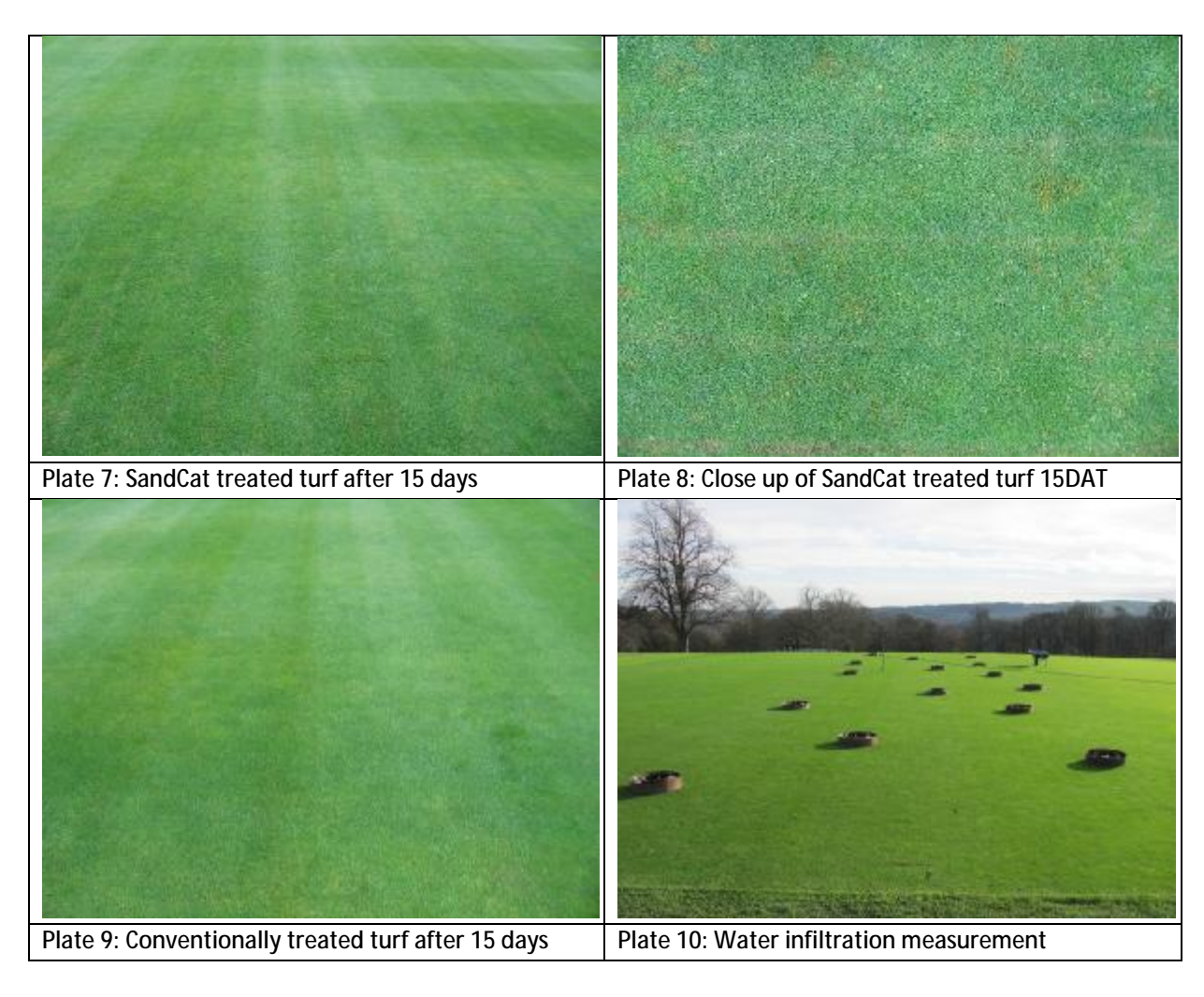
Plates 7-10: Photos of turf recovery after SandCat operation.