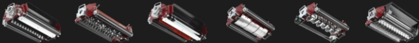
Fraze-Groomer VibeSpike-Aerator CountRo-Sweeper VibeShoe-Roller HiSpeed-Corer VibeSpike-Seeder