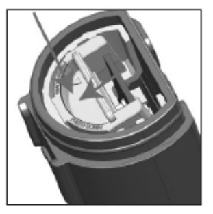
Fig. 4: Push down to lock