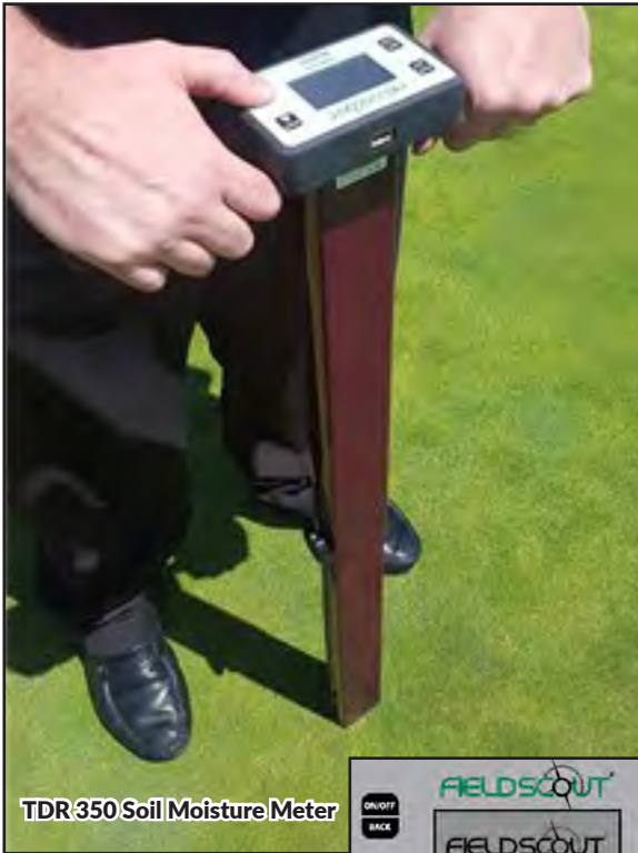
TDR 350 Soil Moisture Meter